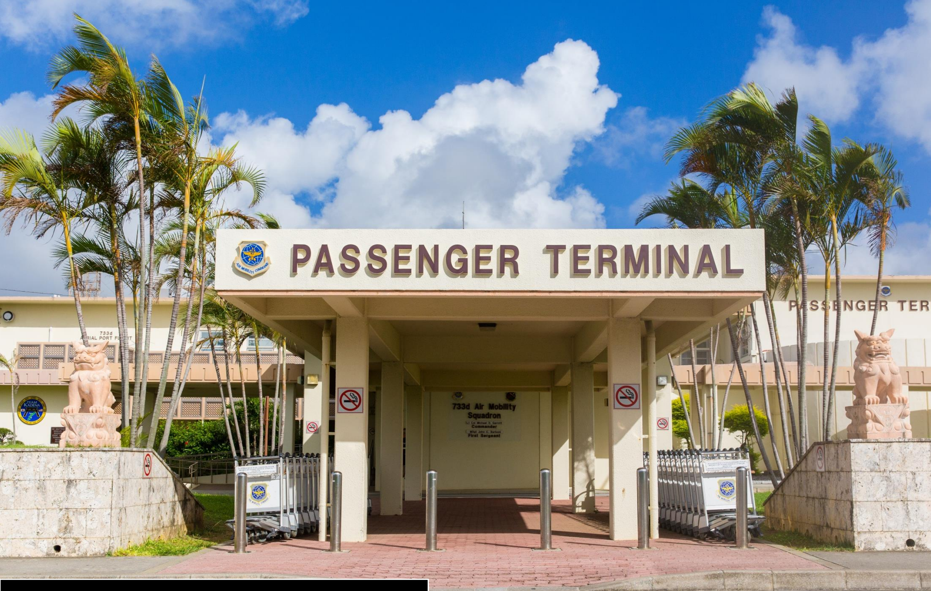
Kadena AMC Terminal