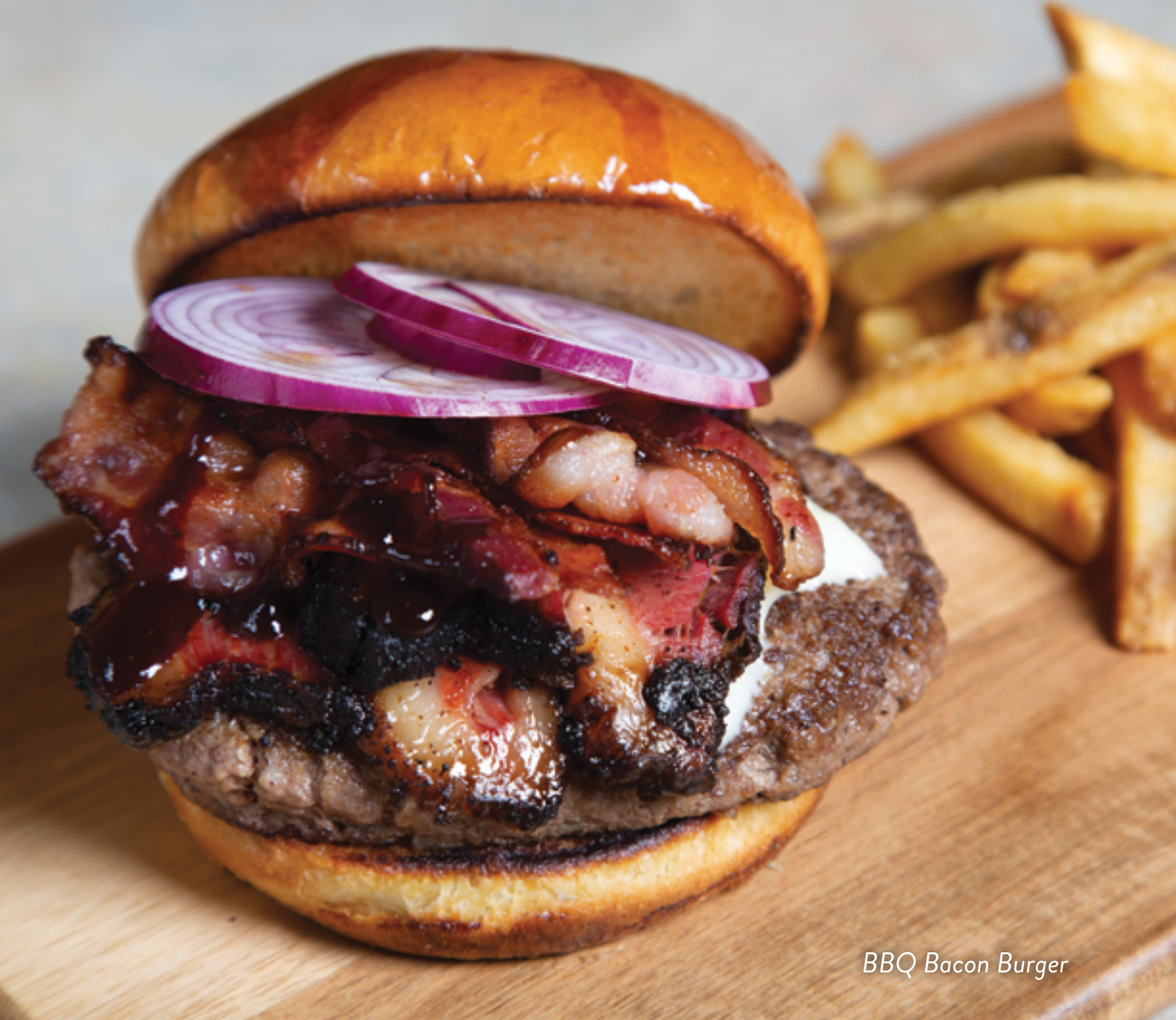
BBQ Bacon Burger