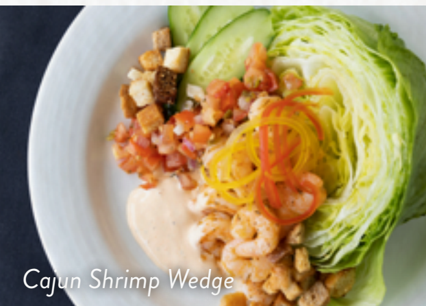
Cajun Shrimp Wedge