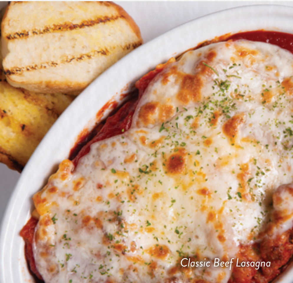
Classic Beef Lasagna