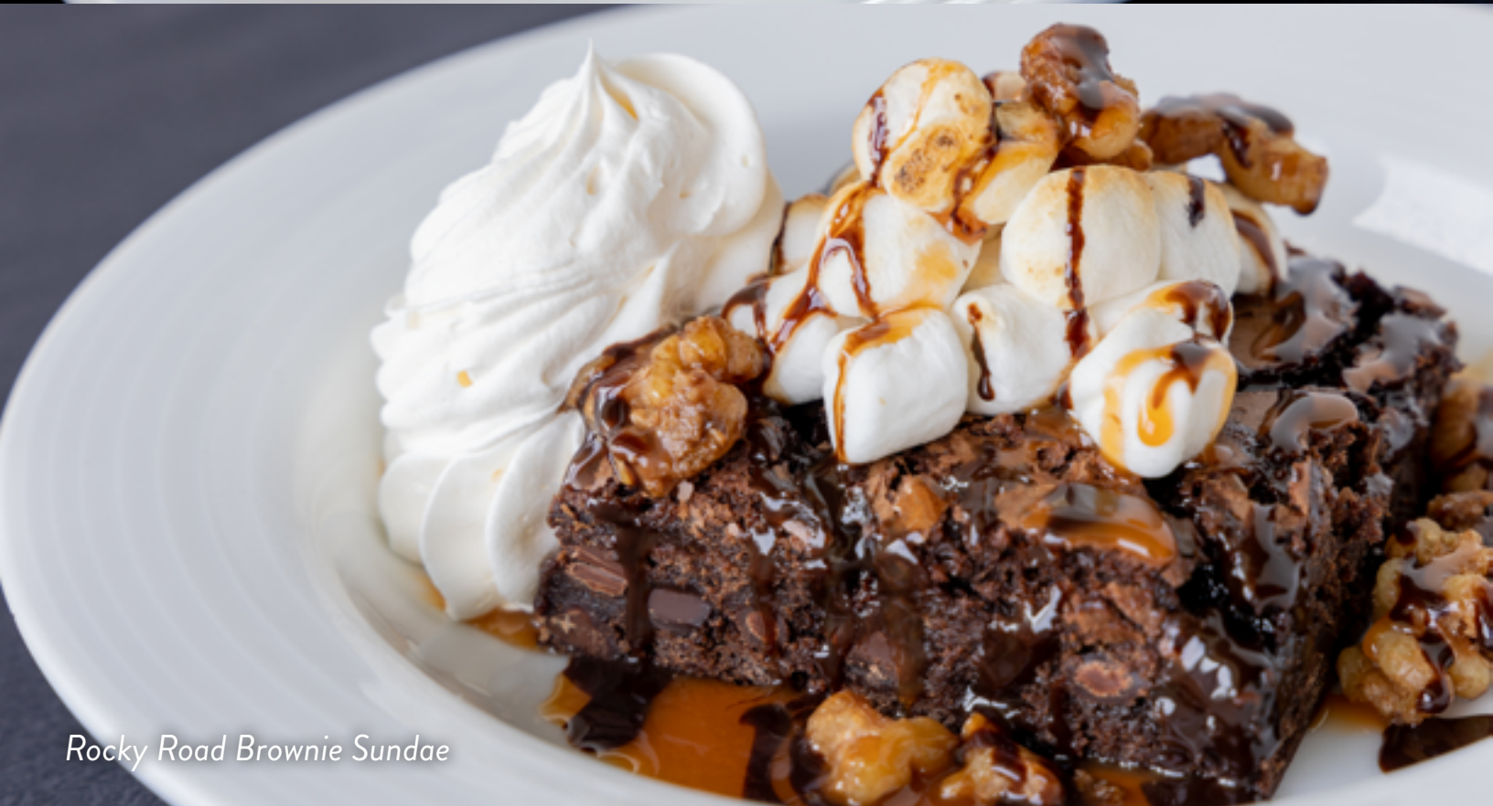
Rocky Road Brownie Sundae