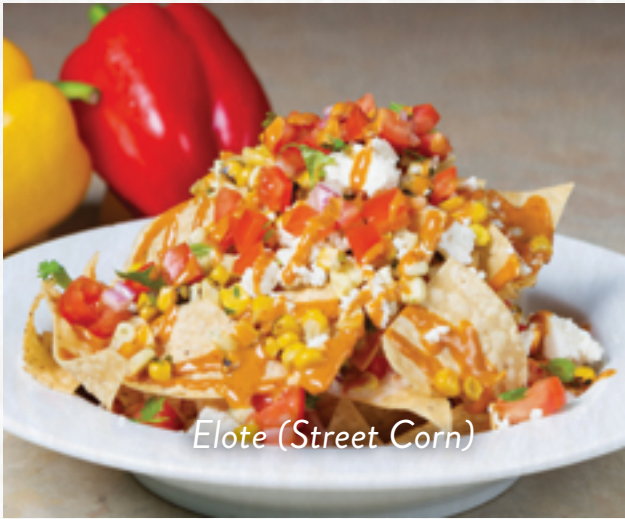
Elote (Street Corn)