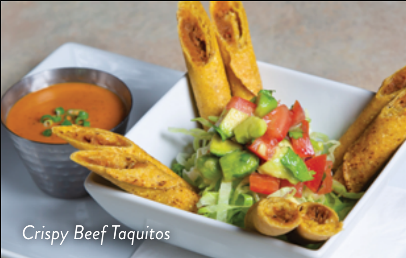
Crispy Beef Taquitos