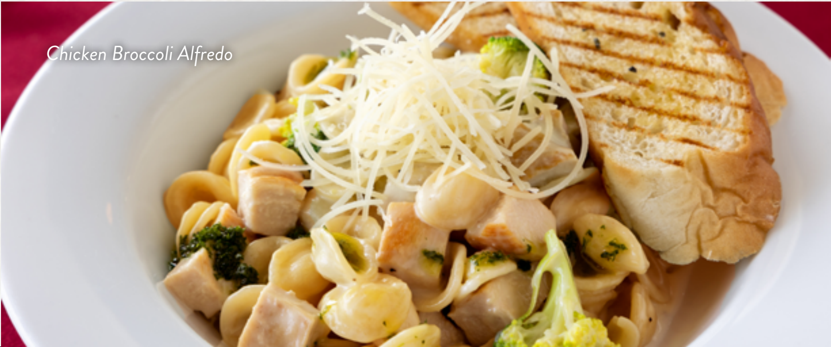
Chicken Broccoli Alfredo