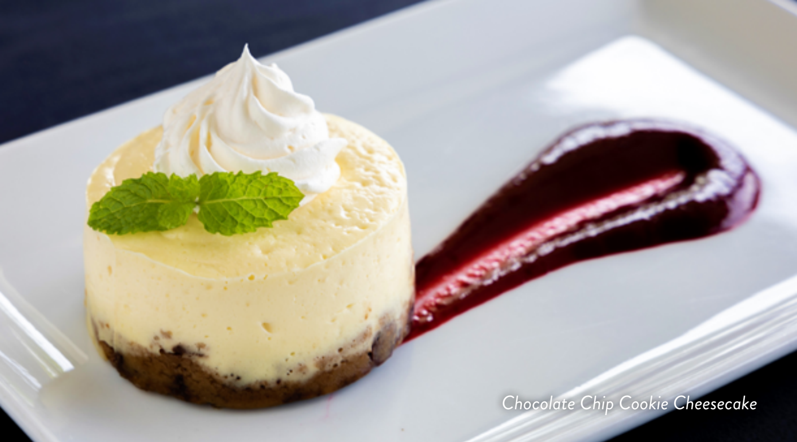
Chocolate Chip Cookie Cheesecake