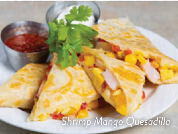
Shrimp Mango Quesadilla

Slow-smoked beef brisket, borracho beans, fresh pico, cilantro rice, chives and gooey cheese sauce rolled into a delicious burrito, topped with a BBQ drizzle.