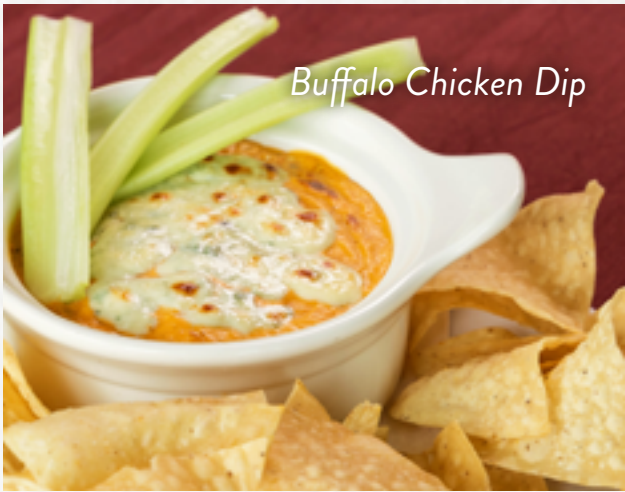
Buffalo Chicken Dip