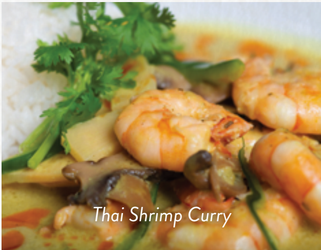
Thai Shrimp Curry